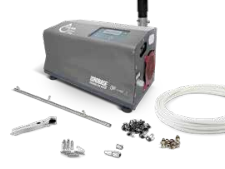
Detail of the sterilising lamp